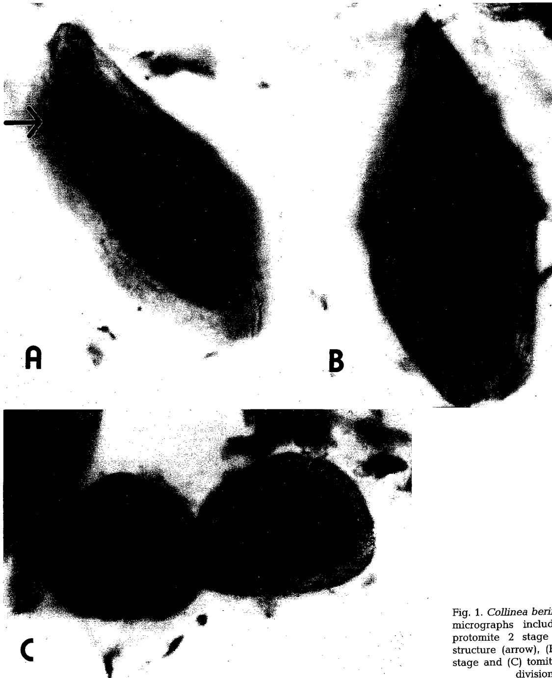
Fig. 1. Collinea beringensis . Light micrographs including (A) the protomite 2 stage with rosette structure (arrow), (B) the tomont stage and (C) tomitogenesis (cell division)

None of the above works note the occurrence of an endoparasitic ciliate in any species of euphausiid. We here describe a previously unknown apostome ciliate endoparasite of the euphausiid Thysanoessa inermis .